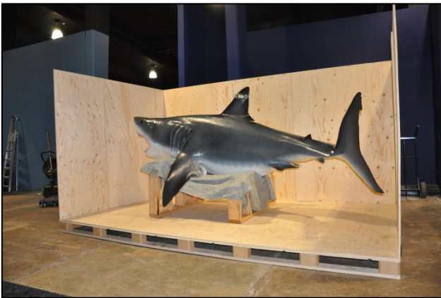
There are clear and unique markings for easy and precise packing